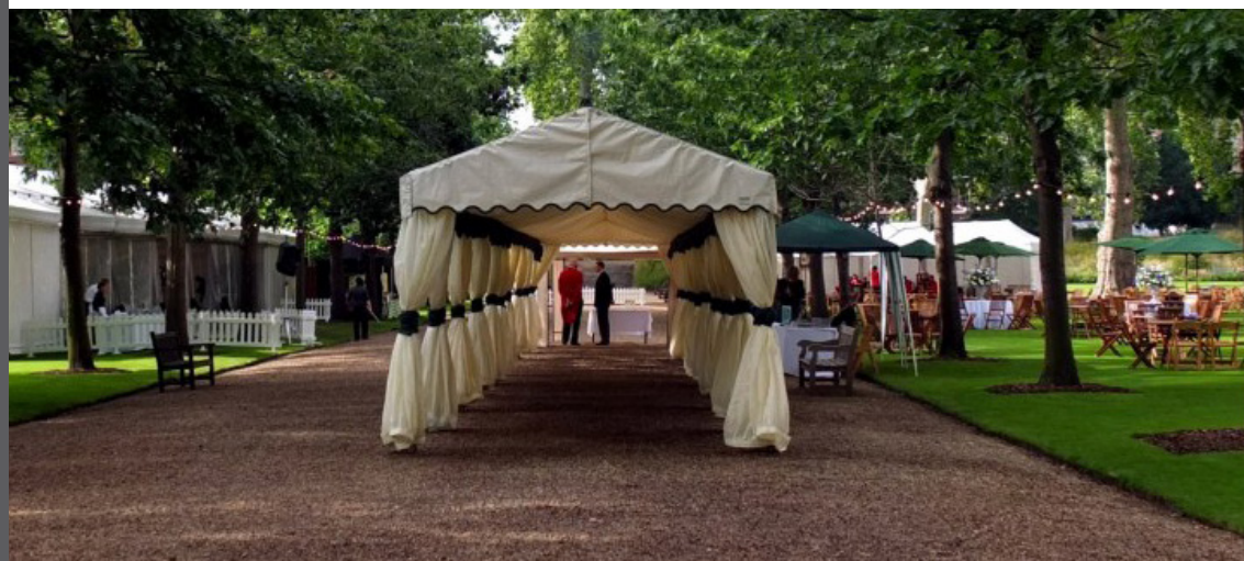
Gray's Inn Prepares to Receive Guests at the Treasurer's Reception in July