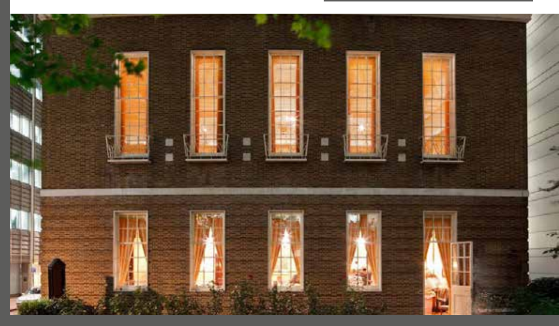
Pewterers' Hall awaits members and guests for the 2016 President's Dinner