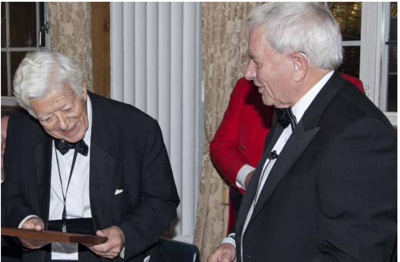
Past & Present - Lord Saville of Newdigate presents his predecessor, Lord Howe, with Honorary Fellowship of The Academy of Experts