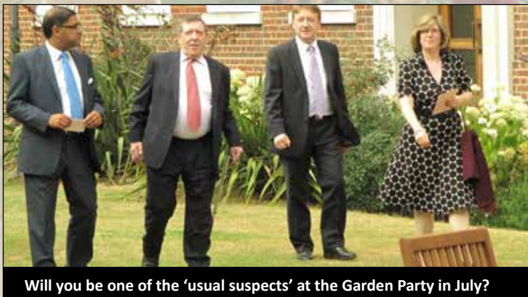
Will you be one of the 'usual suspects' at the Garden Party in July?