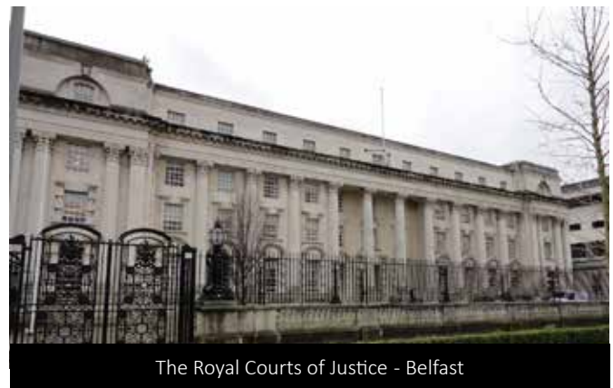
The Royal Courts of Justice - Belfast