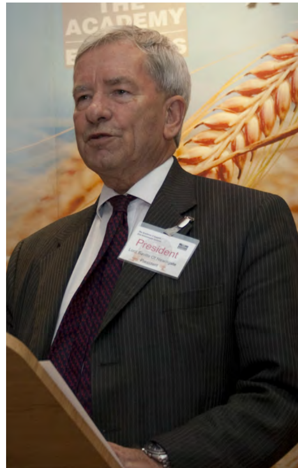
from the archive... TAE President Lord Saville at the 'ADR Lecture' - one of the 21st Anniversary Lecture series