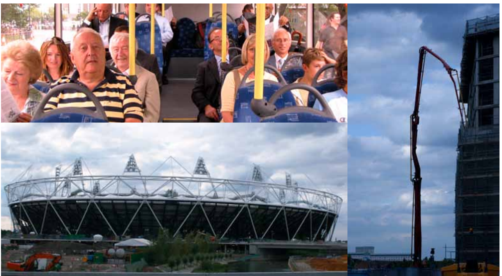
Clockwise from top left: Academy Members on the Olympic Tour Bus, construction of the Athletes' Village, The main Olympic Stadium